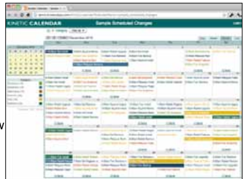
Kinetic Calendar End User View