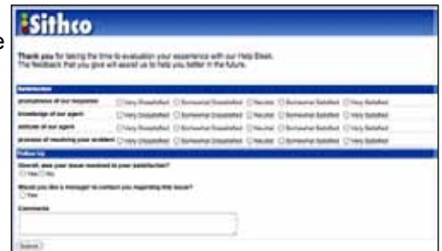
Kinetic Survey End User View