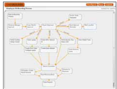
Kinetic Task Workflow