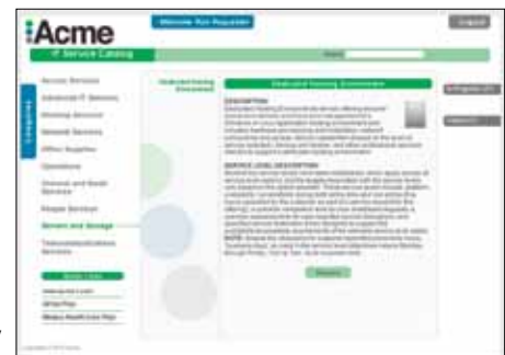
Kinetic Request Self-Service Portal